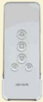
5 Channel Remote Control